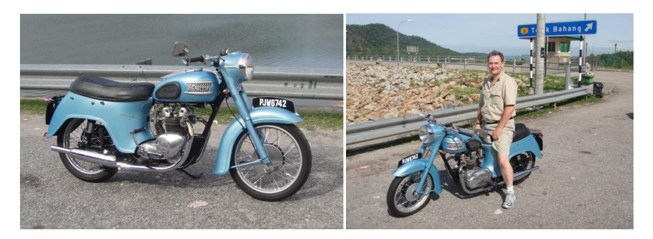
The final cost; do you really want to cause a divorce?

There was one final test and that was for the bike to go to the test centre to get road approval before it could be registered. It failed, no indicators (I ask you, who puts indicators on motorbikes, the same people that fitted an ashtray?) As you will see from the last pics. the bike now has indicators and a Malaysian registration although the sharp eyed among you will recognise a similarity with truck cruising lights. Hey Ho.