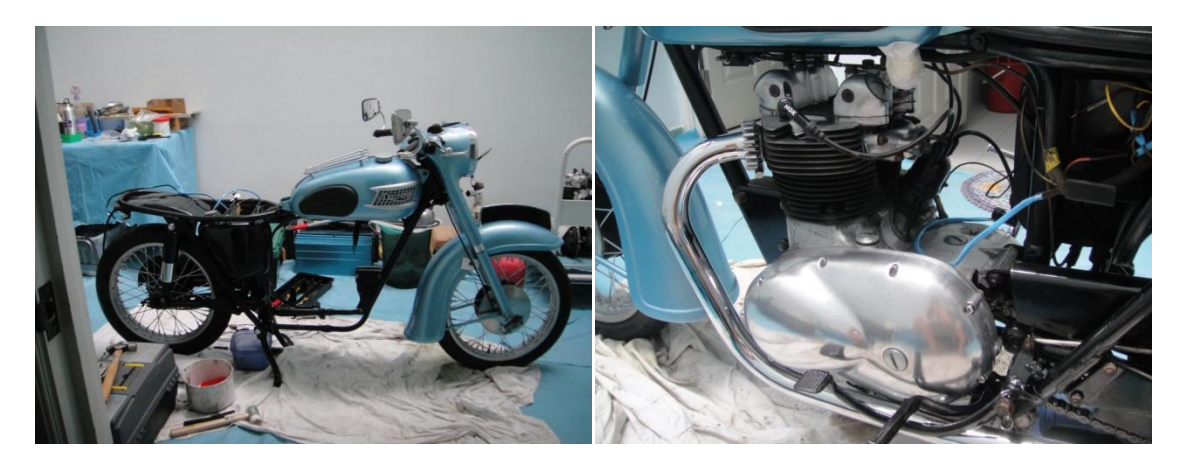
The new electrics make starting a dream. Final act, fitting the rear cowl (bathtub) and the silencers.

says using Halogen bulbs on a 60's bike is heresy; I say I am the heretic who can see where he is going on a very dark night.